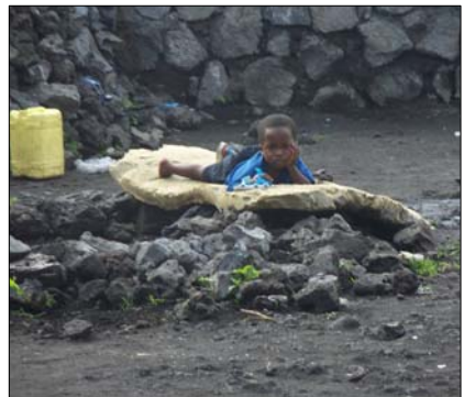
(Below) A little child is resting on some lava rock in the city of Goma