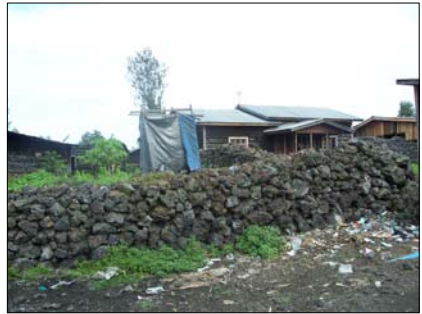
(Above) The Goma Volcano has destroyed the city of Goma twice during the past 50 years. The entire city is covered with volcanic rock.