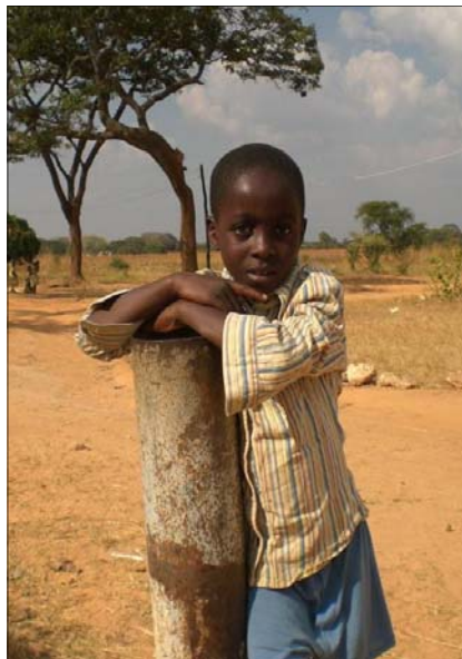
Africa is home to millions of orphans just like this one