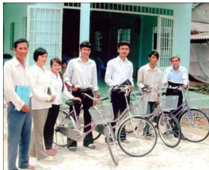
(Below) An evangelism team taking the Gospel to Vietnam via bicycles