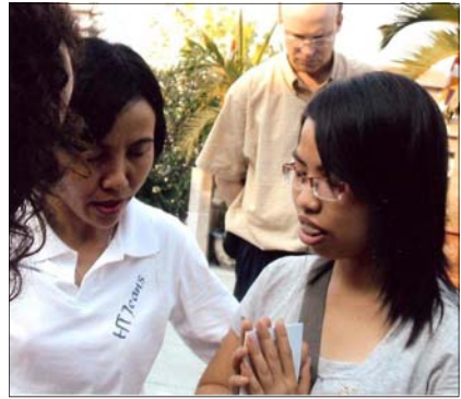
(Above) Buddhist lady accepting Christ on the steps of a Buddhist temple

John chapter four tells us the amazing story of Jesus' conversation with the Samaritan woman at the well. Jesus' grace is displayed as He seeks out this woman, a sinful, social outcast. What a candidate for God's saving grace she was! In verse 23 Jesus says that God, "...seeketh such to worship Him." God not only sought the woman at the